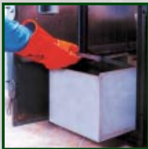
The frequency of ash removal is greatly reduced due to this extra large ash pan.