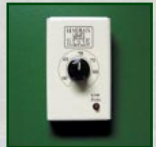
The wall mounted temperature control allows you to set your desired temperature. The PF100 will do the rest.