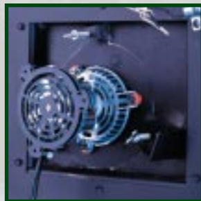
This combustion blower design eliminates the need for a chimney and can be easily removed for annual cleaning.