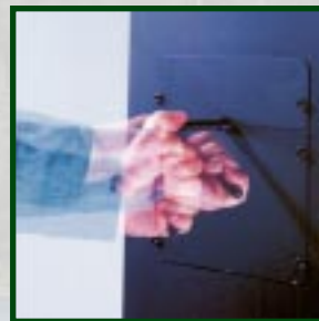
A shaker handle is used to clean the heat exchanger tubes. This is easy to do and is normally done when the hopper is filled.